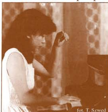
fol. T. Szwed

From August 1995 to October 1996 57 concerts have been organized with 62 soloists from 7 countries (Canada, China, Denmark, Italy, Japan, Poland and Russia). Most of them were from Poland - 27, Japan - 10 and Russia - 7. Summing, 8 recitals and 49 concerts with several performers took place, including 8 concerts with 8 to 12 participants of our international piano courses. 9 concerts were registered, 3 of them were broadcast directly by Wrocław Radio SA company through the Lower Silesia region, other were broadcast with delay or will be broadcast in a near future. Financial problems forced us to limit the number of concerts organized by F. Liszt Society during the period of last 12 months (in November and February all planned concerts had to be postponed).